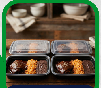
CHIKEN - MEXICAN MOLE