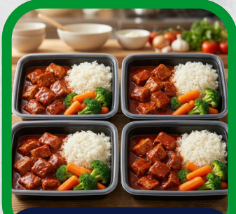
PORK - RED CHILI

Chef-designed menu. customize every bit.