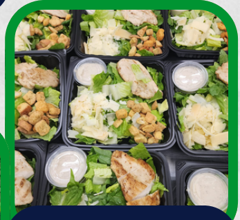
CESAR SALAD WITH CHIKEN BREAST